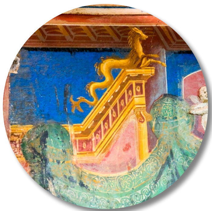
Villa Romana Roman Villa